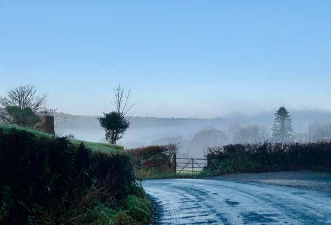
Above: Misty morning in Cardinham, Below: Sunrise over Cardinham