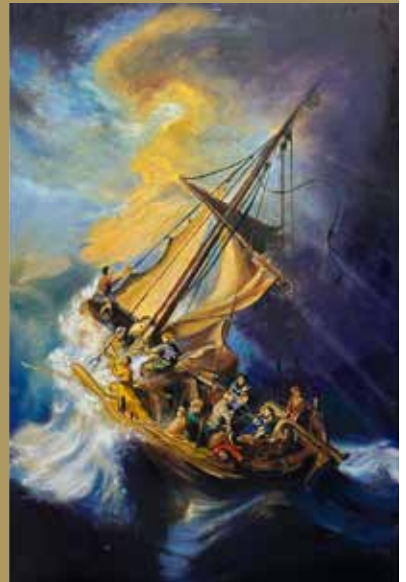
Image: The Storm on the Sea of Galilee, painting by Philip Kamble (Google)